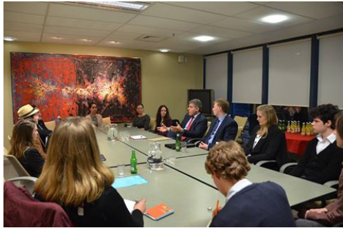
Roundtable discussion with the Canadian High Commissioner, H.E. Mario Bott.

of work youth councils do in engaging young people in local government issues, how those bodies influence decision-making, and comment on the Commonwealth's push for stronger national and local youth bodies.