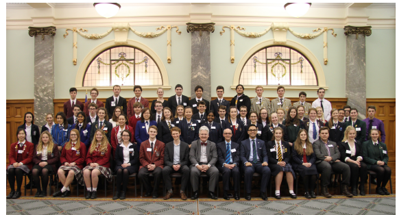
National Student CHOGM Class of 2015

In September we partnered with the Canadian High Commission to deliver a fantastic discussion on biculturalism within New Zealand's multicultural society. One of our members was also lucky enough to be invited to the Commonwealth Games Federation's General Assembly in Auckland to meet HRH Prince Imran of Malaysia, and to unveil the first marker in Auckland's Commonwealth Pathway. We were also able to give 5 of our supporters the chance to attend the 33Sixty programme in Malta. This programme is the successor to 33Fifty, the Commonwealth Youth Leadership Programme, and was held in the lead-up to CHOGM 2015. Some of these participants also attend the Commonwealth Women's Forum, the Youth Forum, the Business Forum, and the People's Forum.